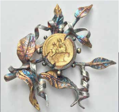
The material can be stretched thin, rolled, formed with patterns, and folded over. This lets you create highly artistic pieces.