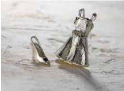
PMC Flex stays supple and doesn't readily stick to the skin, giving crafters free rein for creating even small objects and pendant tops.